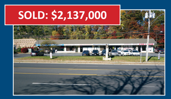
1041 W Jericho Tpke, Smithtown $205/SF - 6.47% cap rate