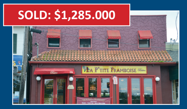
294 Main St, Port Washington $252.05/SF at 6.84% cap rate