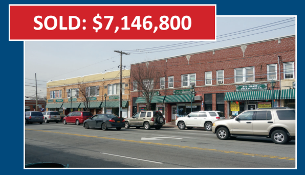
942 Hempstead tpke, Franklin Square $174.31/SF at 7.73% cap rate